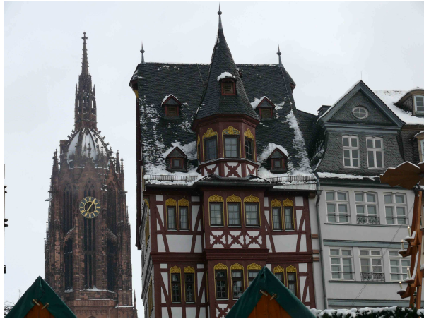
.... passing the Cathedral