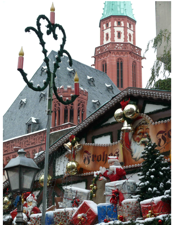
.... and the Nicolai Church